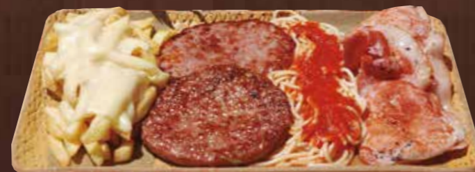
160 MAÓ 10,75€ 2 burgers, bacon, spaghetti with tomato sauce, chips and cheese