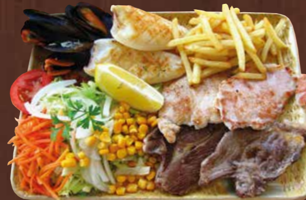
155 MIXED PLATTER 19,75€ Mussels, squid, lamb, chicken thigh, salad and chips