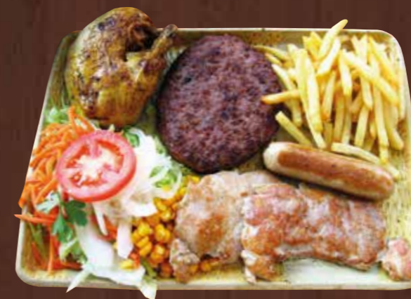
147 SPECIAL PLATTER 13,75€ Burger, chicken, sausage, chicken thigh, salad and chips