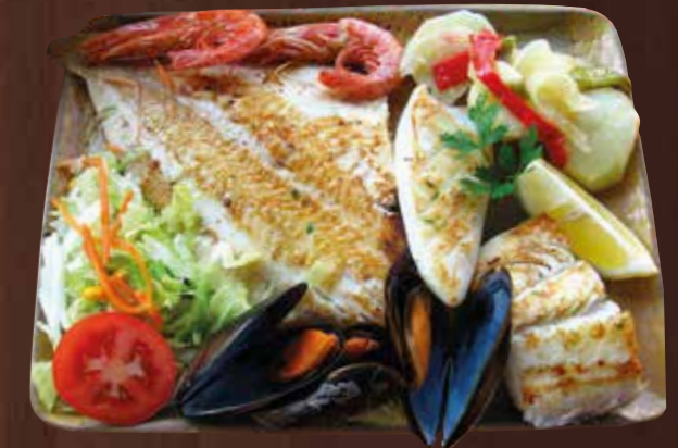
156 FISH PLATTER 25,75€ Prawns, squid, mussels, sole, hake, baked potato and salad