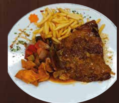
269 BAKED RACK OF PORK 14,95€