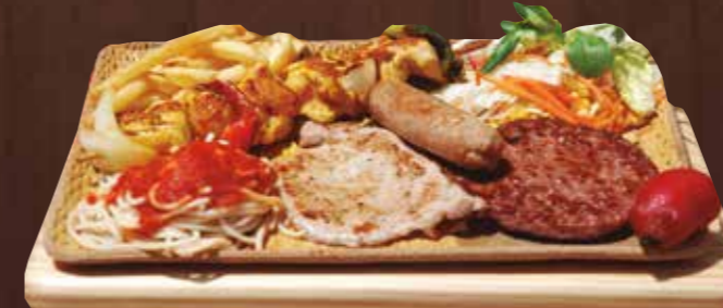
158 TOO MUCH 12,75€ Burger, sausage, chicken brochette, bacon, spaghetti, chips and salad