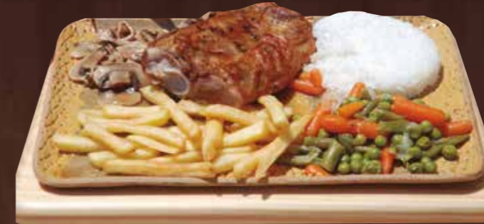
162 MERCADAL 15,95€ 1/2 leg of lamb (300gr approx.), rice, mushrooms, chips and vegetables