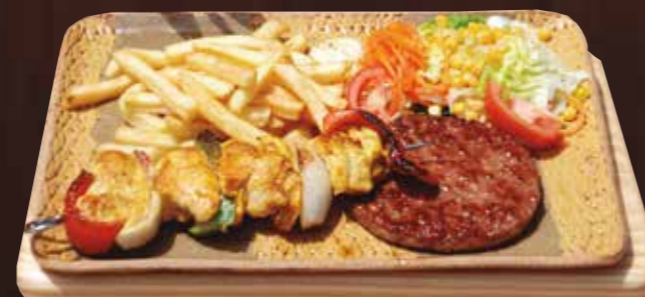
151 XORIGUER 10,75€ Chicken brochette, burger, chips and salad