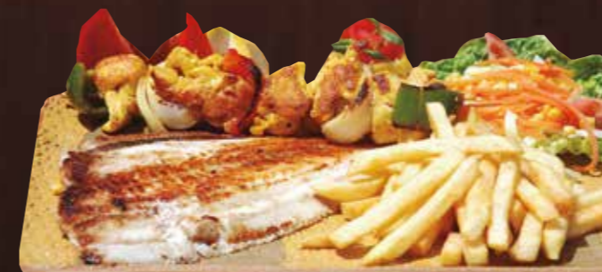
157 CIUTADELLA 13,50€ Grilled sole, chicken brochette, chips and salad

Sauces: Mayonnaise € 0.80 Aioli € 0.80 BBQ sauce € 0.80 Fried egg 1€ Hamburger bread 1€