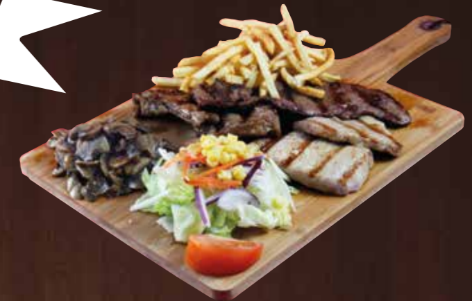
153 MEAT PLATTER 15,95€ Lamb, entrecote, chicken thigh, mushrooms, salad and chips